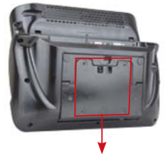
VESA 75 mm x 75 mm