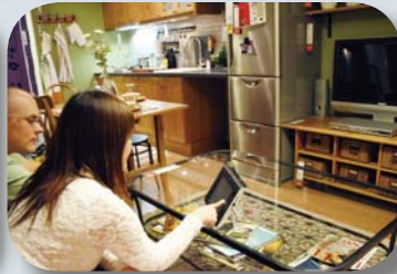
Multimedia Control Center