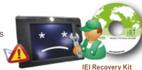
IEI Recovery Kit