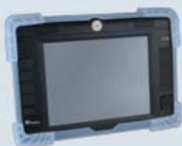
Plastic Protective Shell