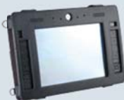
Leather Protective Shell